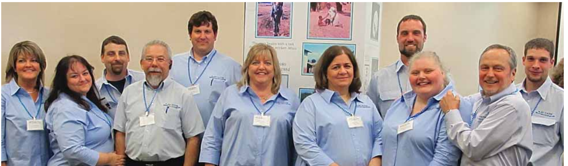
Below: The company currently employs a staff of 12.