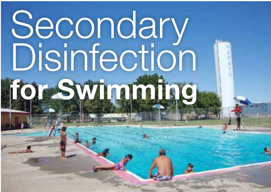
The Olympic-sized swimming pool in Wapato serves the community of the Yakima Valley.

order to eradicate bacteria, reduce chemical usage, enhance filtration and minimize maintenance.